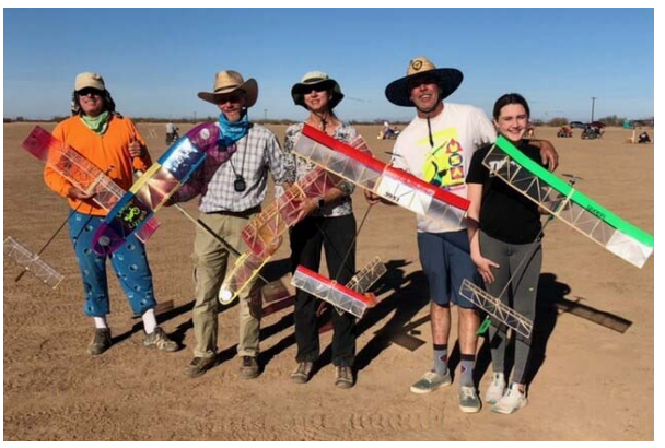
Either 36 or S