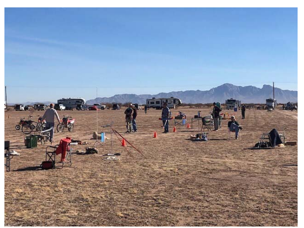
A Field where dreams are made