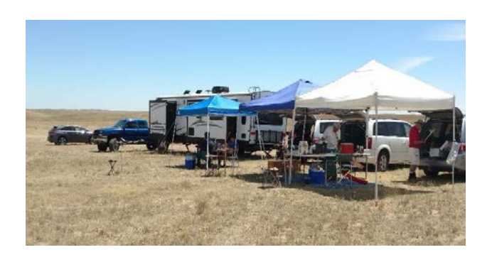
Partial view of flight line on Saturday.

P.S. As this is being written (eleven days after the contest), we're not aware of any participants or family members showing any signs of COVID. We hope it stays that way!