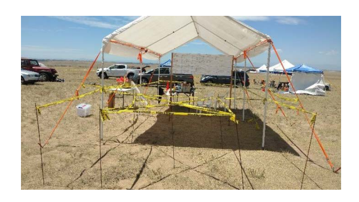
View of Contest HQ. Note the social distancing enforced by the placement of the scoreboard and the two "viewing lanes" in the foreground, on the right and left of the area X'd off with yellow caution tape.