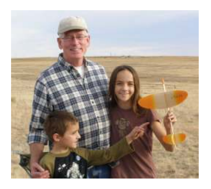
Not to be out done! Ray's Grandkids