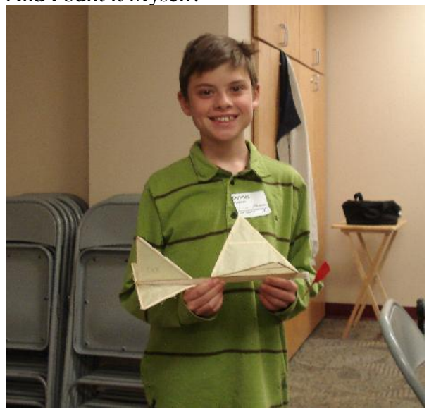
And I built it Myself!