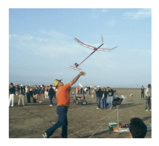
The Launch For the Team !