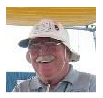
From the MMM Executive Offices Manitou Springs, CO