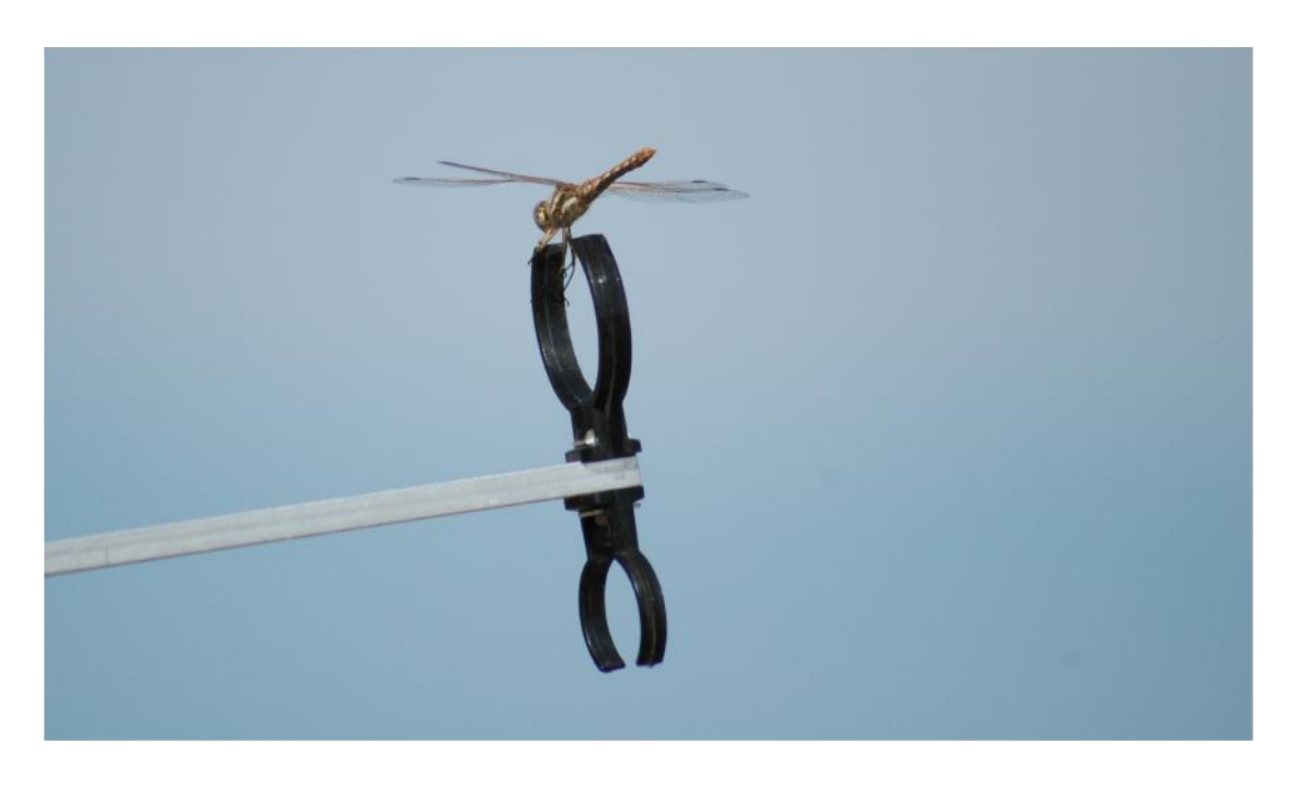
"Dragonfly on Stooge"...perhaps one of the best free flight pictures ever!

Which leads to a thought of many captions for this photo, especially when you consider the Dragonfly on the cover of the latest Digest